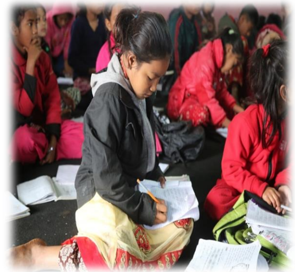
Child Learning Center student doing their school assignment.