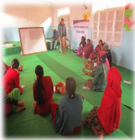
During ‘Women Group Formation and Management’ training class in Jyoti Nawajeevan Church, Nuwakot.