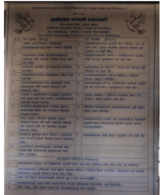
Child Protection Code of Conduct hanging in the wall of Jyoti Nawa jeevan Church service hall.

In partnership with CarNetNepal, Jyoti Nawajeevan Church is running Child Learning Center (CLC); after school program for the 20 poor children of Kanthum. "Our CLC children parent's used to hesitate to send their children in the CLC but after the development and implementation of Child Protection Code of Conduct, they are convinced that Church is a safe place for their children and feel comfortable to send their children in CLC classes." Says Ps. Rajan Gurung.