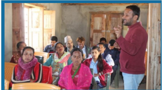
During the formation of LCCHT, VCPC and RIC.

LCCHT is supposed to handle the human trafficking activities and cases of Ralukadevi in coordination with the