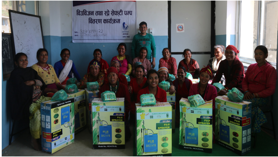
Shikherbesi-7 women with vegetable seeds and sprayer pump.

Sitaula. CarNetNepal is promoting sustainable livelihood through income generation activities from vegetable farming among the locals of Shikherbesi.