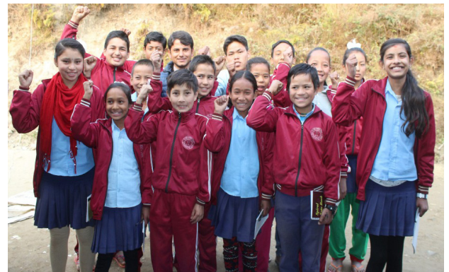
Ralukadevi Child Club Members.

After the reformation CarNetNepal have provided orientation classes on Child Club activities to the Child Club Members and assisted them in making their monthly action plan. CarNetNepal is providing these Child Clubs with training on Child Protection issues such as Child Right, Child Abuse, and Child Trafficking. The Child Clubs are now actively involving themselves in bringing social awareness on Child Physical and Sexual Abuse and other Child Protection issues in their schools and soon planning to intervene in their community as well.