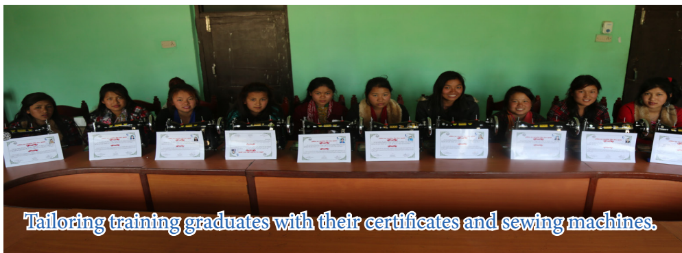
Tailoring training graduates with their certificates and sewing machines.

...their name for the training to CarNetNepal. "The training aims to provide technical skills to the trainee girls and women, so they could involve in their own income generation activities and keeping them away from the unsafe migration." Says Purushottam Dotel- Cluster Manager, CarNetNepal. According to Ms. Chameli Sunuwar- tailoring training Trainer "Now these girls and women are able to run their own tailoring shop in their villages or could work as an assistant trainer in any tailoring institute." On the occasion of the graduation ceremony, Chief- Guest of the program, Bimala Subedi- Former CabineMember distributed certificates and sewing machine to each trainee and encourage them to put their learnings into practices.